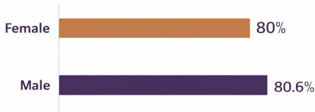
Percentage of Employees who received a Bonus:

The median bonus gap between male and female employees improved slightly in 2025 compared with 2024, with 5.76% of male employees receiving a higher bonus payment. In 2024 the median bonus gap was 6.1%, meaning that male employees received bonuses that were 6.1% higher than those received by female employees. The mean bonus gap also improved in 2025. In 2024 the mean bonus gap was 6.7% in favour of male employees, whereas in 2025 the mean bonus gap was -0.99%, meaning that the average bonus payment received by female employees was slightly higher than that received by male employees.